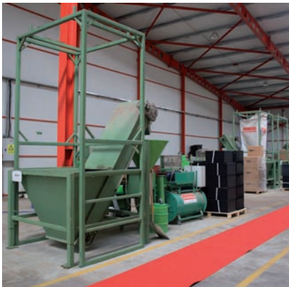
The new factory hall

In an earlier edition of our newsletter, seven years ago, we wrote that the new factory in Turkey was nearing completion. In recent years, we had been working hard at this beautiful location near Antalya. However, the Turkish government had quite a surprise in store for us: they wanted to build a new ring road, straight through our factory site! Fortunately, after careful consultation, a good alternative location was found, and the factory has now been moved.