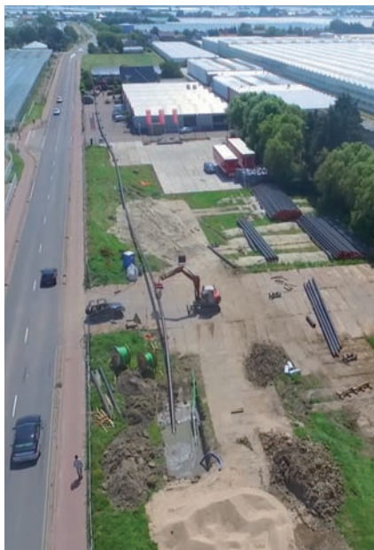
Installation of geothermal heating

The plot has been used for various purposes: for storage of the transport pipelines, as a soil depot, and as an installation place for the soil augers. It was also used to prepare and dig in the expansion loops and transport pipelines.